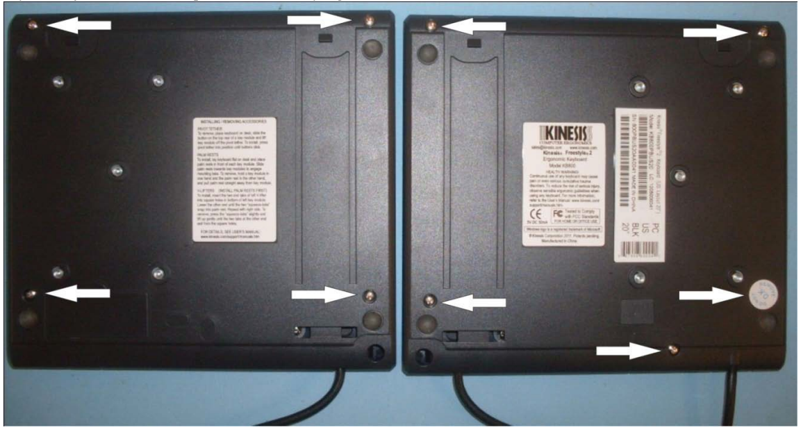
Figure 1. Underside of assembled keyboard, arrows show 9 screws which must be removed with small-head Philips screwdriver (one screw is under the "do not remove label"). After removing screws, separate top of keyboard from bottom. Repeat on other keying module.

First remove the pivot tether (if attached), then remove the bottom enclosure from the one or both keying modules, as needed. See Figure 1 below.