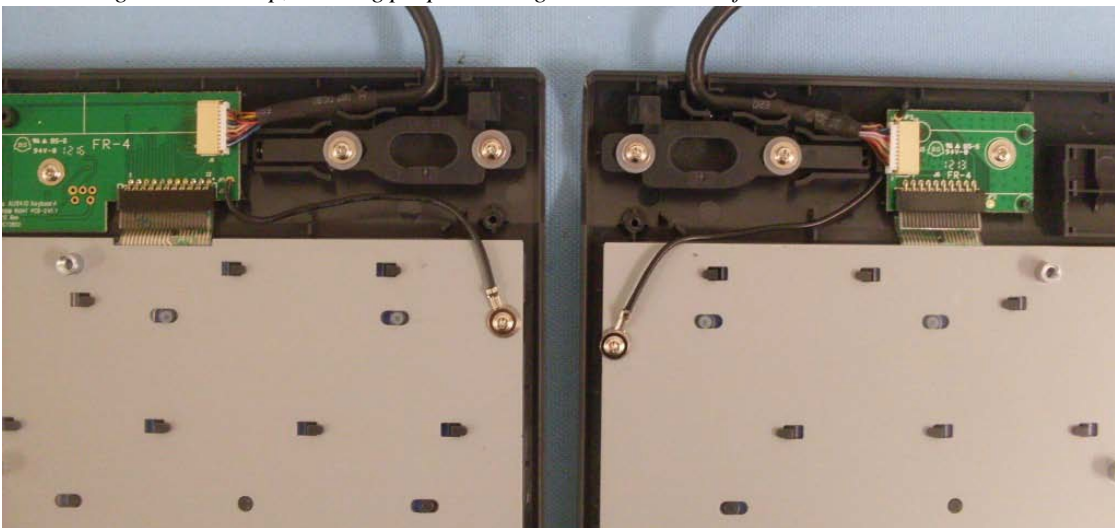
Figure 3. Closeup, showing proper routing and connection of cables.