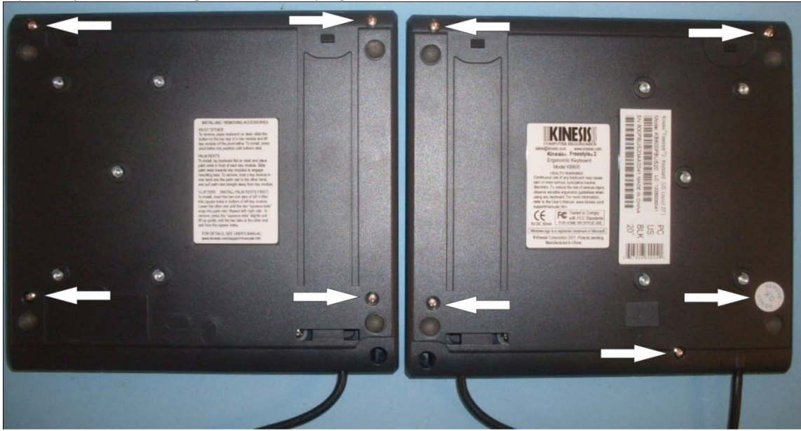
Figure 1. Underside of assembled keyboard, arrows show 9 screws which must be removed with small-head Philips screwdriver (one screw is under the “do not remove label”). After removing screws, separate top of keyboard from bottom. Repeat on other keying module.

First remove the pivot tether (if attached), then remove the bottom enclosure from the one or both keying modules, as needed. See Figure 1 below.